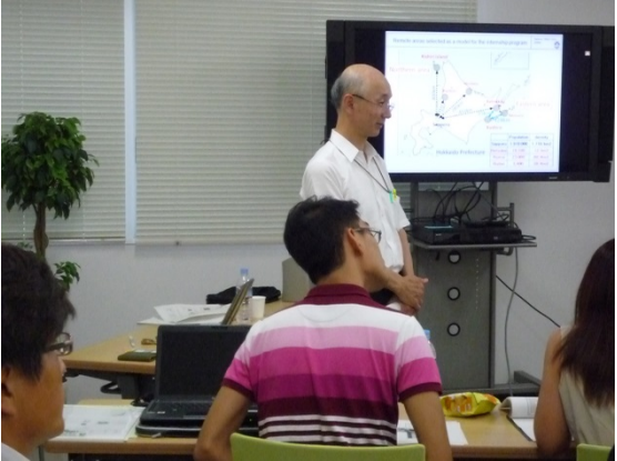
Third day (22<sup>nd</sup> Aug. 2013)