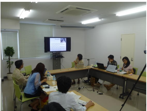
Confer a Certificate of the course completion

All of the participants completed this course and received a certificate.