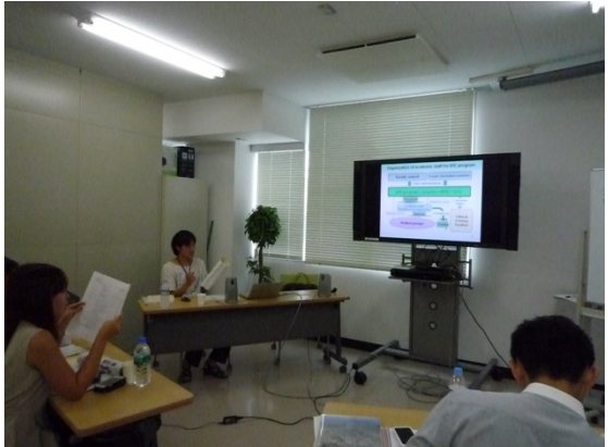
She explained the IPE training program at Gunma university using textbook used in our university