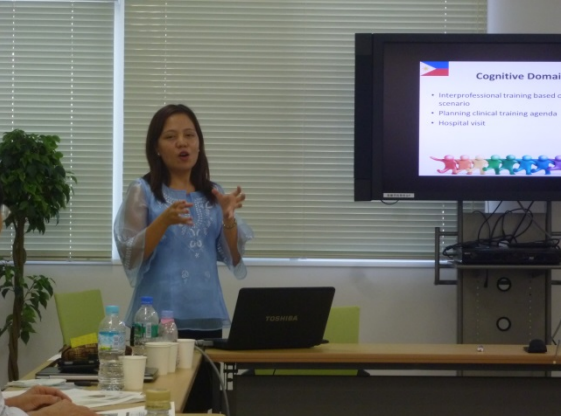
Exchange of Views with Faculties of Gunma University

Participants and exchange of views and opinions with faculties of Gunma university. In this session, we discuss the possibility of collaboration with each other.